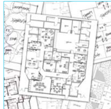
Floor plans / preliminary ideas

Project Management / Move Coordination Coordinate Furniture Installation Architect, Lighting, Electrical, and Structural Consultant Coordination